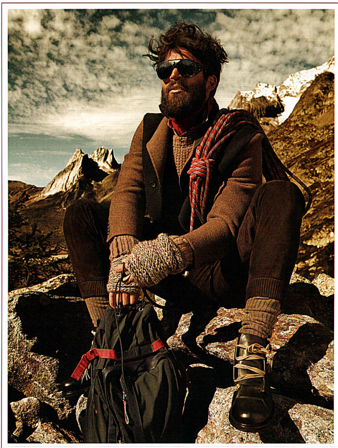
× Giacca e pantaloni Louis Vuitton , pullover e guanti Dolce&Gabbana , collo in lana Moncler Grenoble , scarponi Emporio Armani 590 euro, zaino Marni 690 euro, occhiali Salice 62 euro, corda Ferrino ×